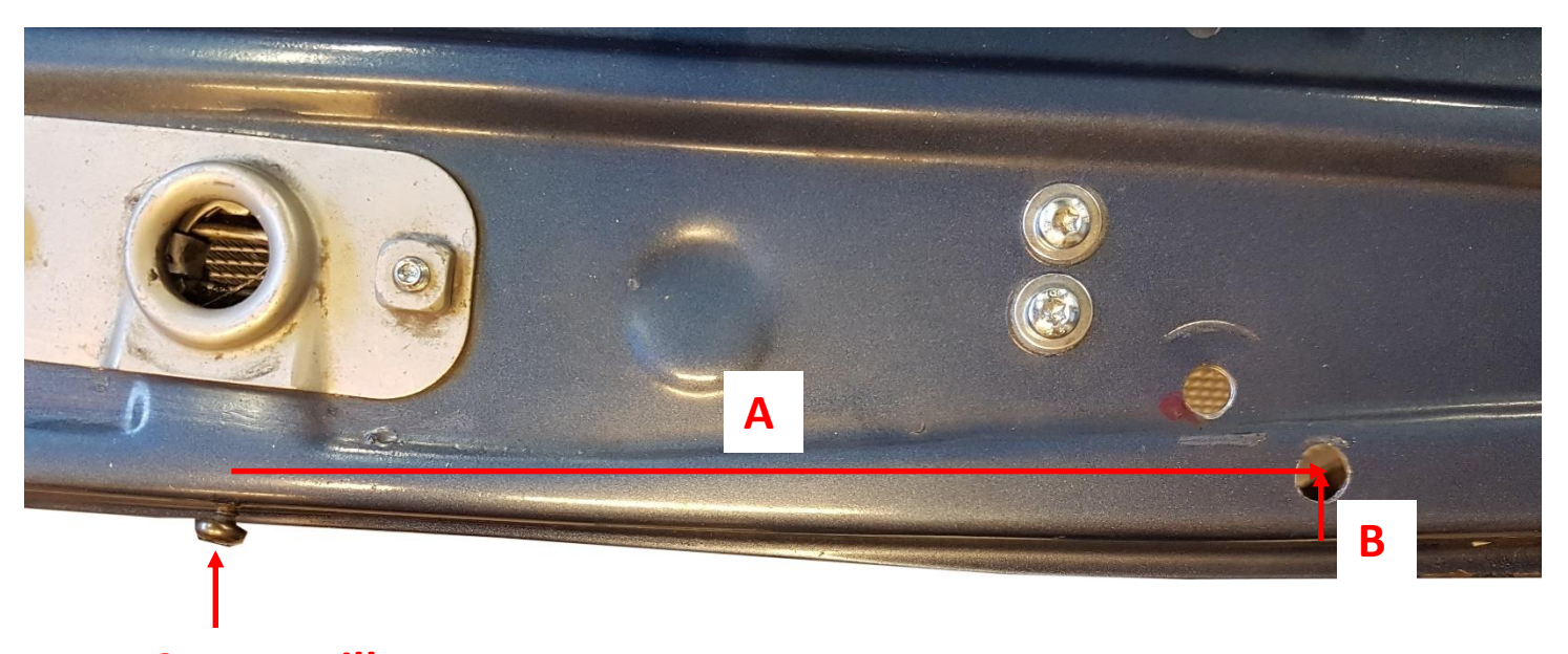
Center grille screw

The measurements are the same on both left and right sides of the center grille screw.